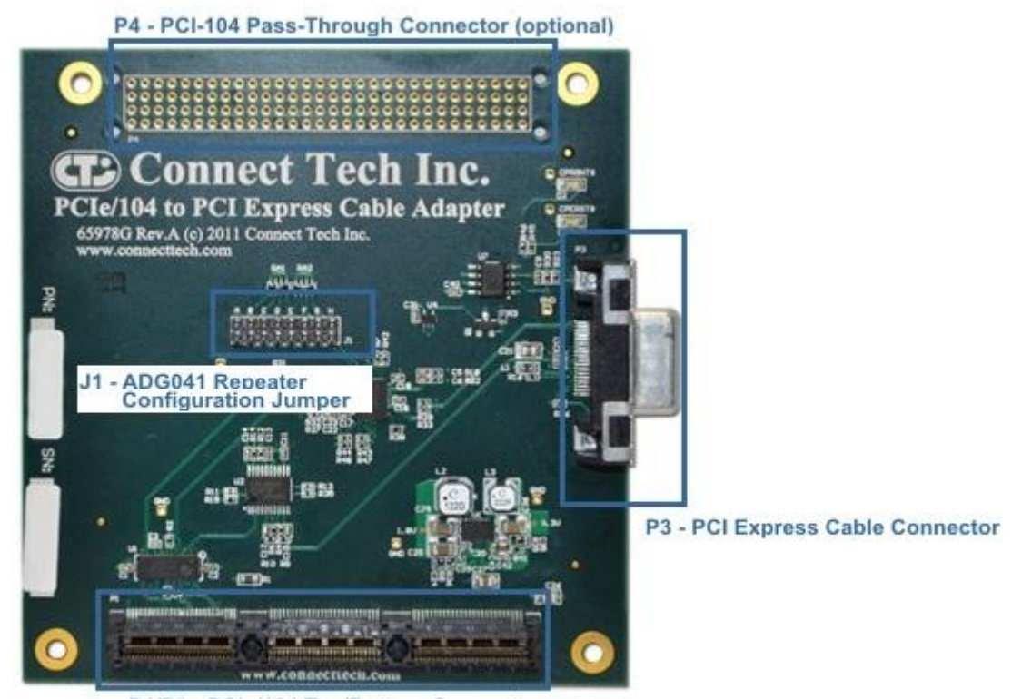
P1/P2 - PCIe/104 Top/Bottom Connectors